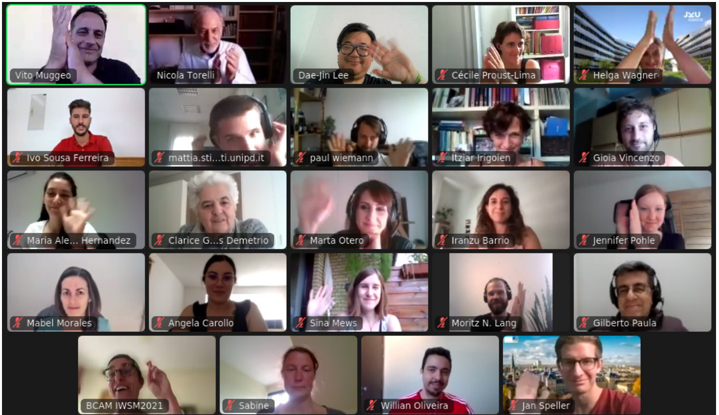
A screenshot of bye-bye at the online IWSM2021