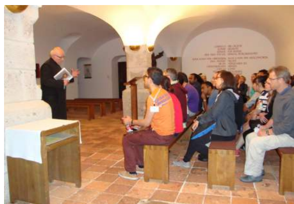
Excursion at Kremsmünster Abbey