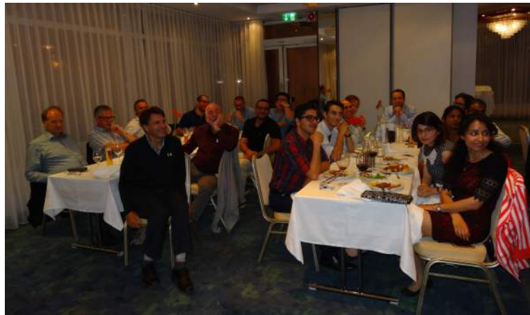
Conference dinner at Arcotel Nike