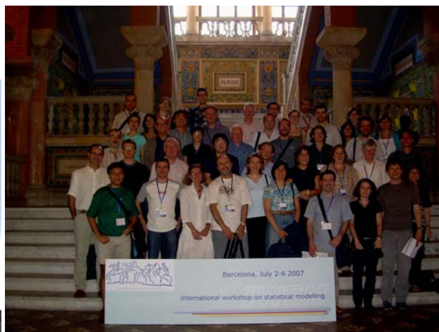
The last day, the last picture...