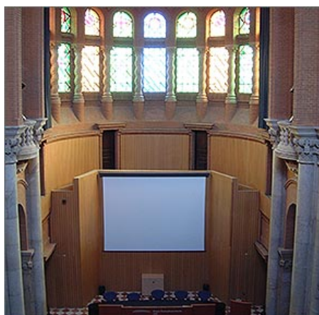
CASA DE CONVALESCÈNCIA (UAB)

The IWSM 2007 brought together 201 statisticians from 27 countries. There were 6 invited, renowned speakers (Bayarri, Casella, Keiding, Molenberghs, Pfeffermann, and Wood), 52 contributed oral communications, and 70 posters. The number of participants and presentations has confirmed the interest in statistical modelling and its importance. A full day pre-conference